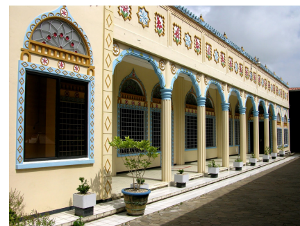
A Hindu temple in Paramaribo, Suriname.

and limits on their ability to practice their traditions, most Hindus in Jamaica eventually converted to Christianity. A population once thought to be as high as 50,000 dwindled to just under 1,500 by 2000, but recent immigration to the countries has steadily increased the population there. Though many in Guyana, Suriname, and Trinidad & Tobago also converted, the countries managed to maintain significant populations, largely due to the willingness of Hindu leaders to adapt to their new