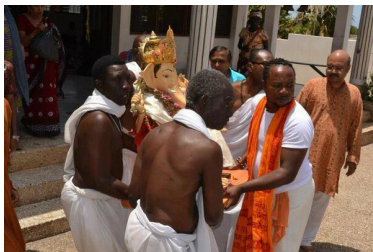
Hindus in Ghana celebrating the Hindu holiday, Ganesh Chaturti.

Hinduism came in waves to Africa, with Southern Africa getting Hindu workers during the early years of British colonization, while East and West Africa experienced Hindu migration during the 20th century. South African Hindus played a significant role in the struggle against Apartheid, with figures such as Monty Naicker becoming leaders in the national struggle against minority white rule. Today, the Hindu community remains a strong presence in major cities such as Johannesburg, Cape Town and Durban. Hinduism is the majority religion in Mauritius. In Ghana, it is one of the fastest growing religions, due to the rapid increase of Hare Krishna devotees among native Ghanaians.